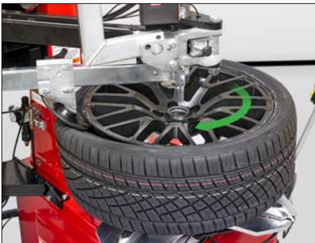
A single bead press roller disc can quickly assist mounting and demounting stiff sidewall tires.