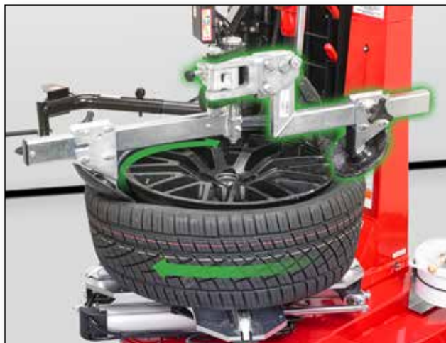
The flip down, fixed bead press arm adds additional contact to service the most extreme low-profile tires and deep drop-center wheels.