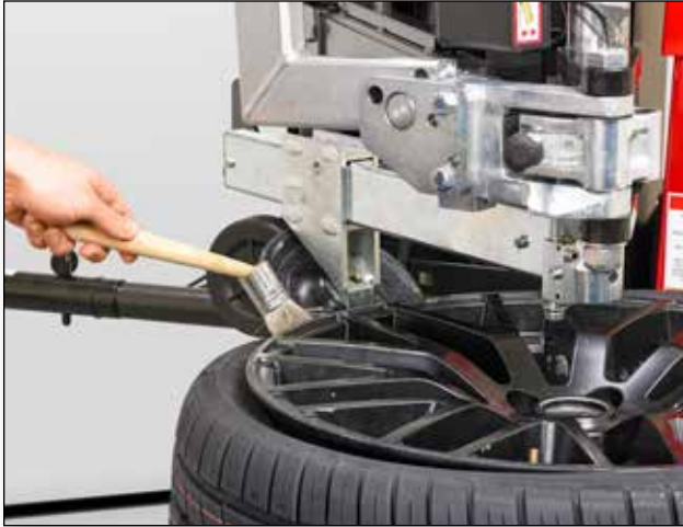
Rollers discs assist bead lubrication and ease demounting.