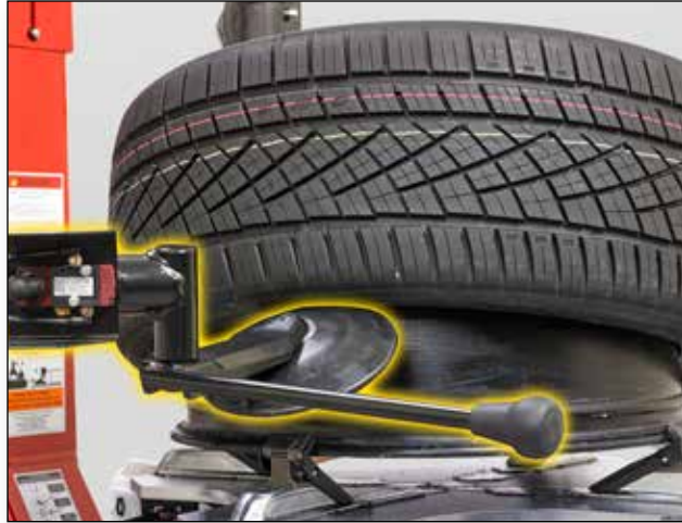
The bottom roller disc can be used for bottom bead re loosening, demounting or match mounting.